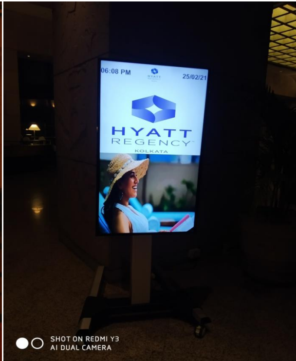
SHOT ON REDMI Y3 AI DUAL CAMERA