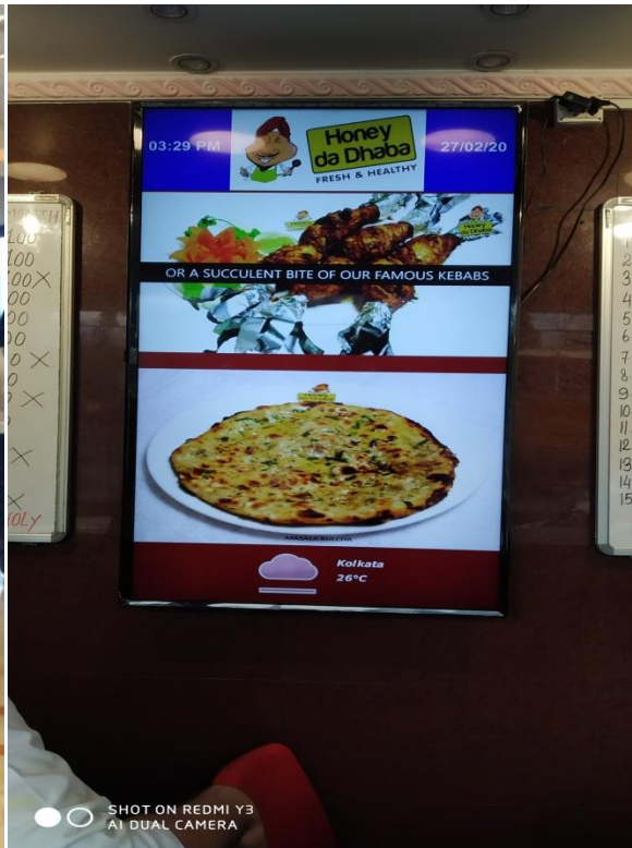
SHOT ON REDMI Y3 AI DUAL CAMERA